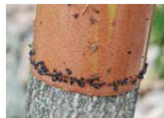
Figure 4. A banded tree with SLF nymphs stuck at the bottom.

Any tree can be banded, but we recommend specifically banding tree-of-heaven, the preferred host, or trees where you see a lot of egg masses or nymphs (Figure 4). Special tape for this purpose can be purchased, though duct tape wrapped backward and tight to the tree also works well. Push pins can be used to secure the band. Adult SLF will avoid tape, so it is essential to band trees in the spring when there are nymphs. Be advised that birds and small mammals stuck to the tape, while rare, have been reported. Check and change traps every other week.