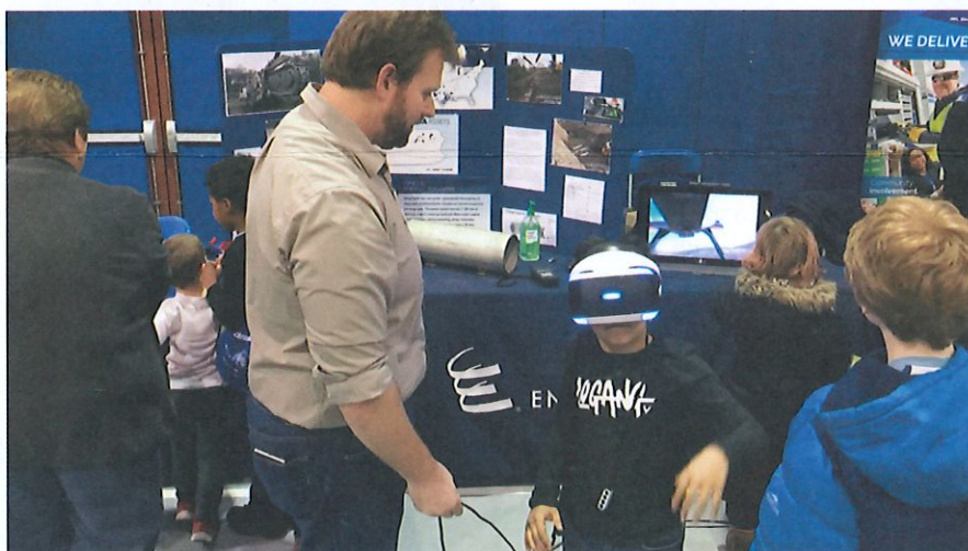
Energy Transfer employees participated in the Science Festival held at Penn College of Technology. The event saw 1,500 middle school students attend from the area during the day and was open to the public in the evening. Students were able to take a virtual reality tour of an operating compressor station and learn about the numerous safety aspects of a pipeline. Energy Transfer was one of the main sponsors of the festival.

We currently have 1,035 full-time employees in Pennsylvania, with offices and operations centers in Delaware, Chester, Berks, Dauphin and Butler counties. We safely operate nearly 3,000 miles of pipeline infrastructure and gathering systems, as well as terminal and storage assets, in Pennsylvania.