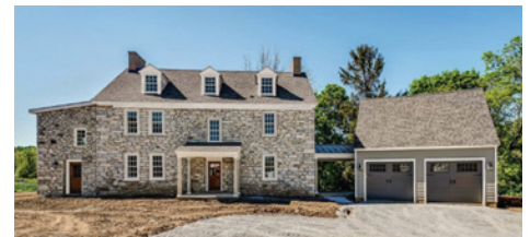
Lochiel Farm Manor

Church Farm School sold the tract in 2001, but it wasn't until 2017-2018 that the full plan for the properties came together with the development of Lochiel Farm community. The tenant house was moved to join the manor house at the rear of the tract. Both homes needed massive renovations to bring them up to current building codes and desirable living standards. The work included window replacements, roof repairs and replacements, repointing of the Manor House, a new foundation and rear addition for the Tenant House, and complete interior fit outs for both.