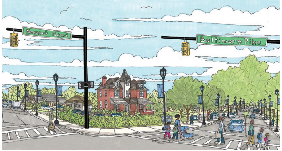
Rendering from Village of Toughkenamon: Streetscape and Transportation Improvement Plan .

Streetscape amenities like the ones shown in this rendering were presented at the Conversations with Businesses event and to the Public Services Commission in