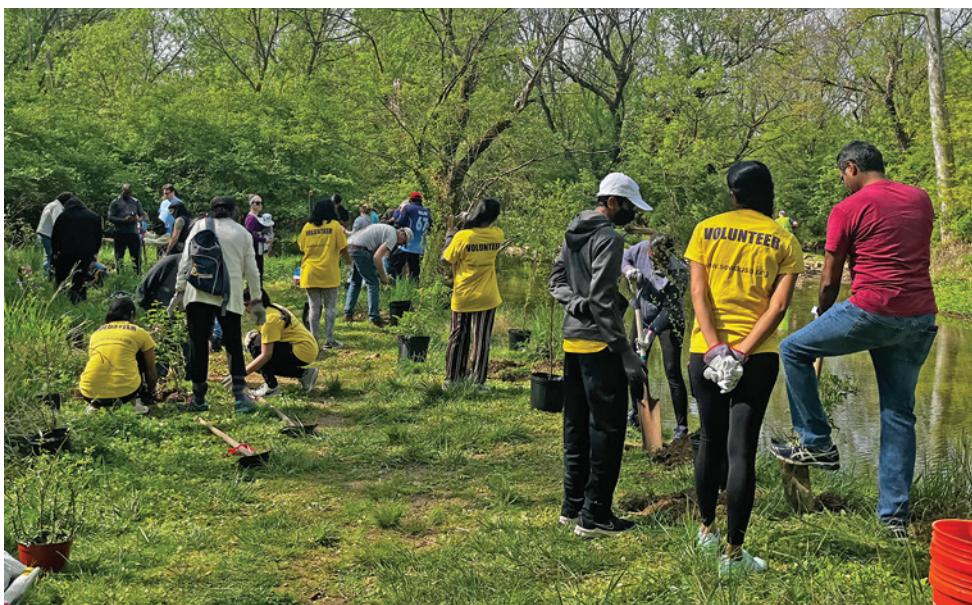
SEWA International, local businesses, and community members pitched in to plant trees and flowers at Miller Park.

Visit retrievr.com/wwhitelandpa to see what clothing and electronics items Retrievr can pick up and recycle for you!