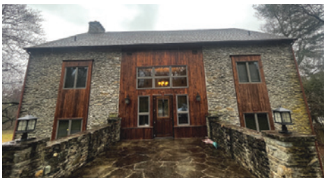
Davis Dairy Farm Barn