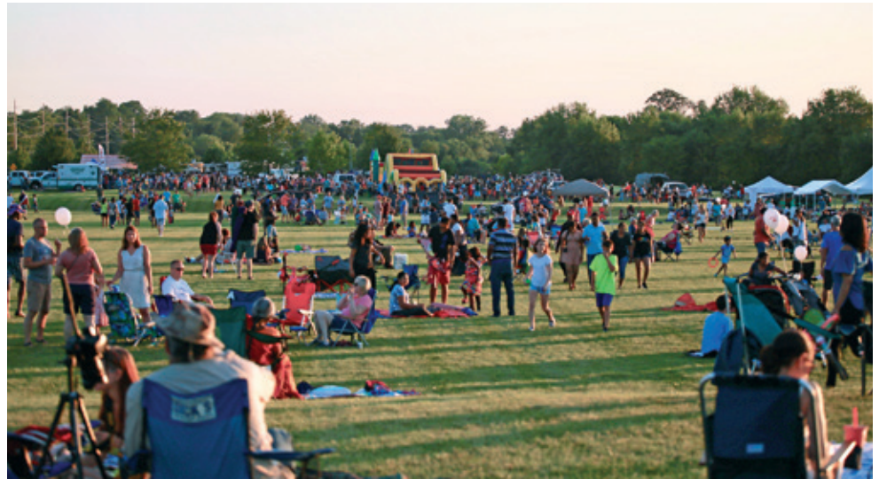
Exton Park Community Day