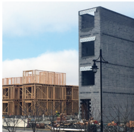
Ashbridge at Main Street is currently under construction on Commerce Drive.

Check our website closer to April 9th for more specifics about the timing and subject matter of the presentations.