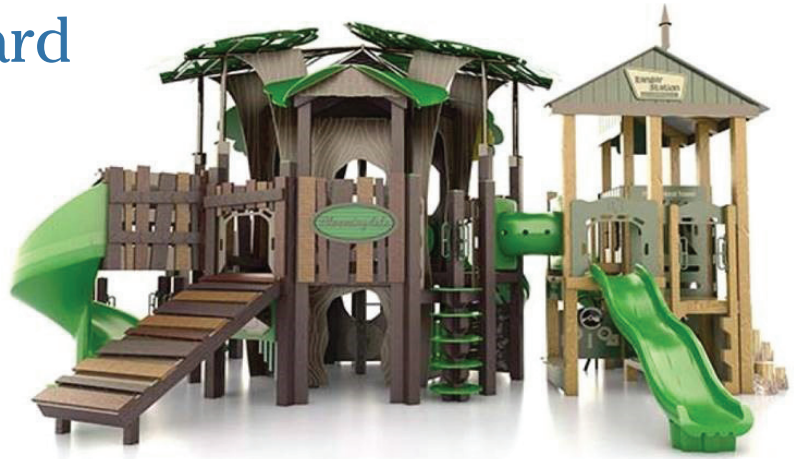
Sample natural playground structure under consideration for Exton Park

In November, the Pennsylvania Department of Conservation and Natural Resources (DCNR) awarded West Whiteland Township a grant for $500,000 for the development of Exton Park. While most of the 279 acres of park that the Township owns will remain passive open space, there are plans to construct a recreational area just off of Swedesford Road. This space would house age-appropriate and accessible natural play areas, a dog park, parking, restrooms and a natural walking trail. The goal of the improvement is to bring together individuals of all ages and abilities to enjoy the beauty and central location that Exton Park provides.