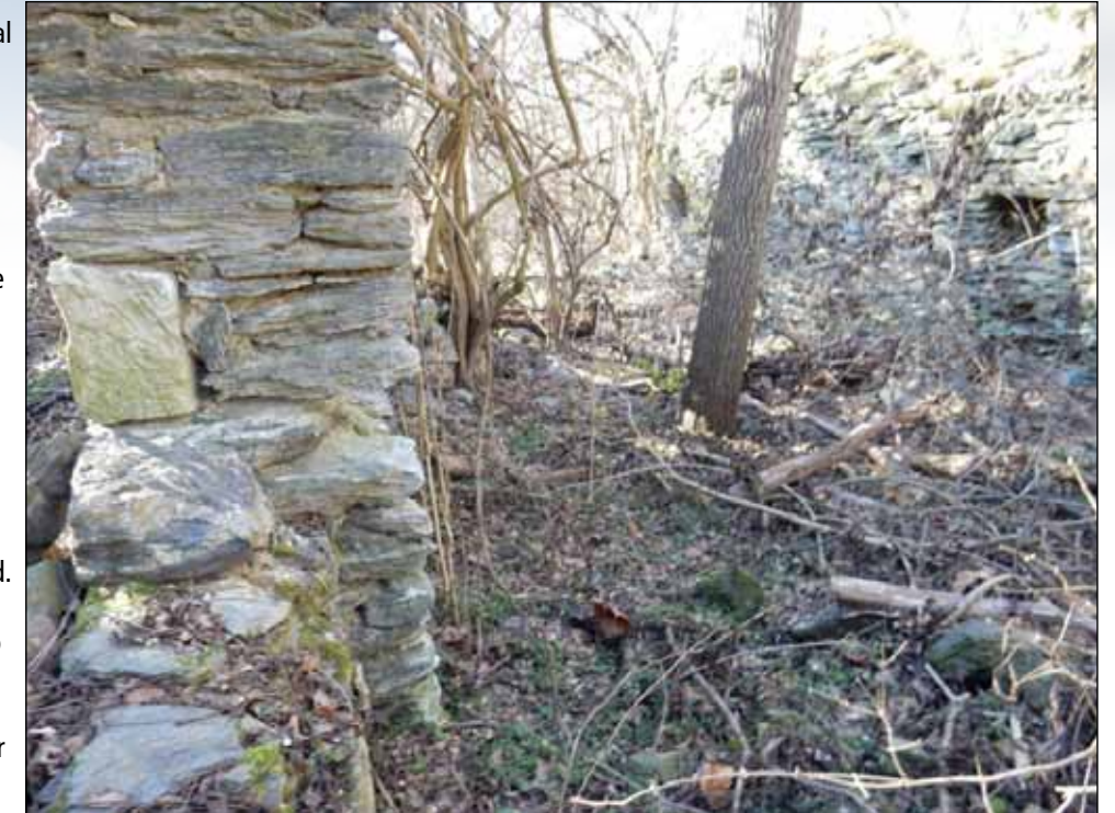
View through old door or window of Hoopes Mill ruins

Just west of Whitford Road, on the north side of the track bed, sit the interesting ruins of the old Hoopes Mill and Oakland Station. The Hoopes family occupied what is now the Duling Kurtz Country Inn as a residence and operated the grist mill. The ruins are clearly visible from the old rail bed. The Historical Commission is working with the owner of the Oaklands Business Park to stabilize the ruins and offer informational signage for users of the trail. These efforts will preserve evidence of relics and ruins for generations to come.