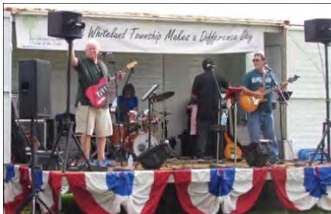
The Bulldogs took the bandstand at MAD