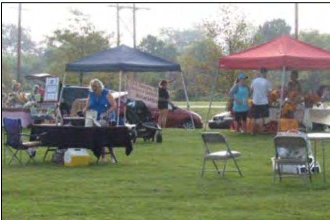
Vendor fair at MAD